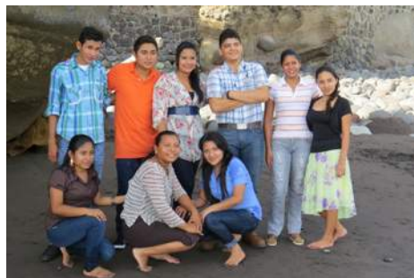
University scholarship students at the beach.