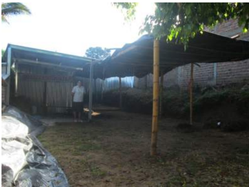
Original day-care shelter