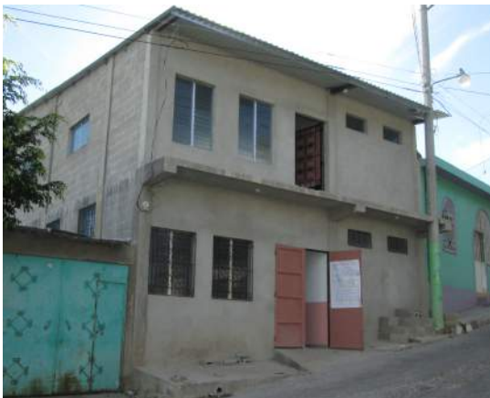
Newly constructed clinic

Using money from the profits from their second-hand store, the sisters have been able to hire a half-time doctor and nurse. Future plans call for a small laboratory for processing blood samples. The doctor, who wants to dedicate her life to helping the poor, is willing to take a small salary of $500/month.